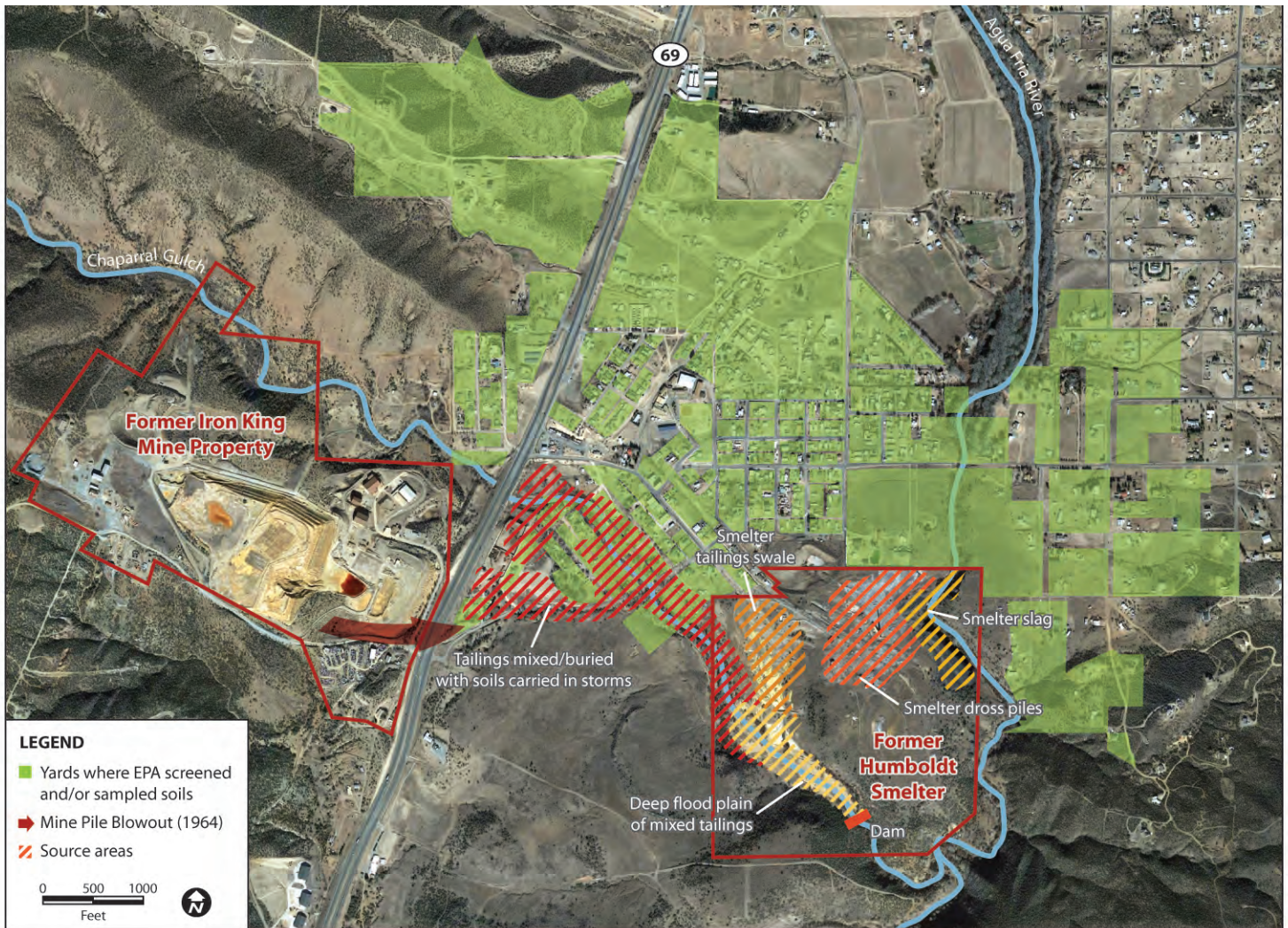
Figure 1: Map of Iron King Mine/Humboldt Smelter Superfund Site